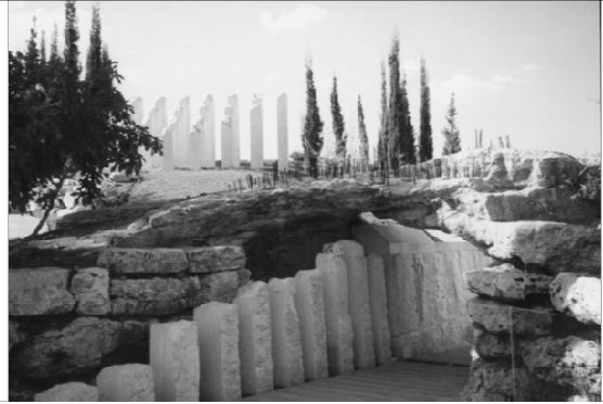
Yad Vashem (Children's Memorial)